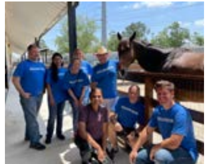
Volunteering at SPCA & Wildlife Center