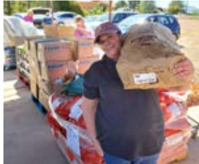
Volunteering at Feed My Starving Children