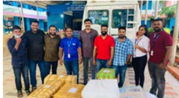
Trivandrum Back to School Drive