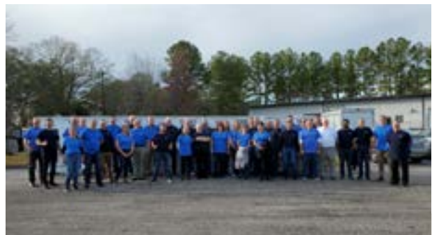
Durham Rescue Mission Holiday Event