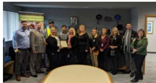
Exemplary Employer Award