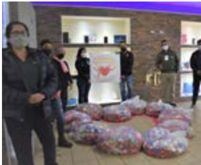
Plastic Cap Collection for Cancer Patients