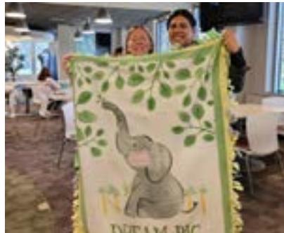
Making Tie Blankets for Cancer Patients