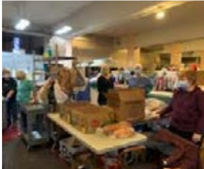
Donations To Project Concern

RRD's vision is to strengthen the communities in which our employees live and work, and we are responsive to the emerging needs that challenge our employees and their communities. Multiple activities were performed throughout the US, Canada and Mexico in support of local communities.