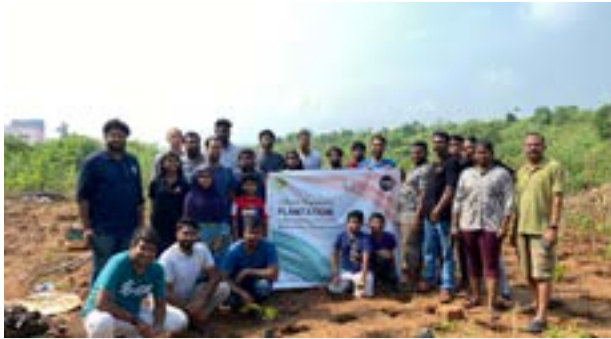
“Chennaiil Vanam” Urban Forest Tree Planting