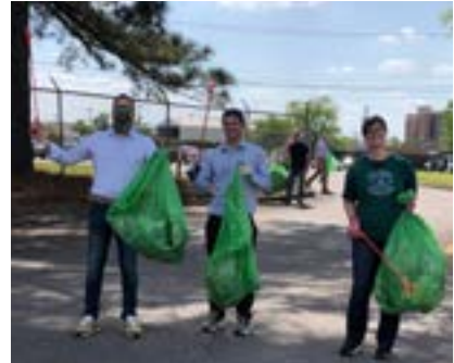
Earth Day Community Clean-Up