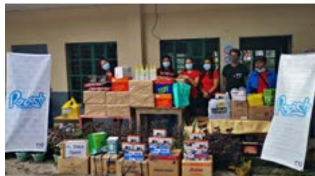
Manila Elementary School Support

RRD employees worldwide routinely work to make a positive difference in the communities in which they work and live. Examples include: