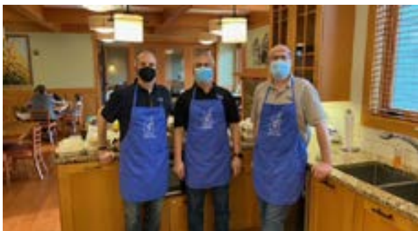
Cooking Meals at Ronald McDonald House