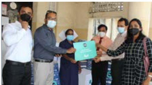
In Solidarity With Sri Lanka